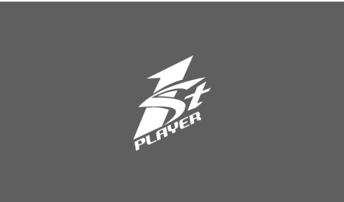
CPU LIQUID COOLER TS1-360-WH