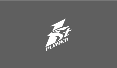
CPU LIQUID COOLER CC 360