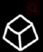
Keycaps with high PBT content