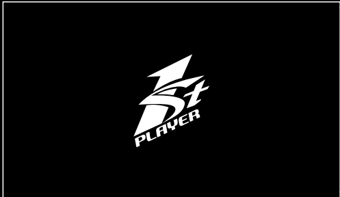
MK 980 PRO