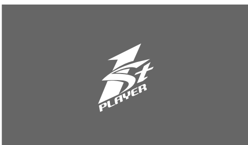
GAMING KEYBOARD ARIYA